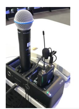
Dual Radio Microphone Kit Lapel + Handheld Microphones

> Handheld Microphone: To be used by students who are physically present in the room (in-person students) when participating in class discussion or Q&A activity etc. It can also be used as a second microphone for multiple presenters i.e., guest presenters, class tutor etc.