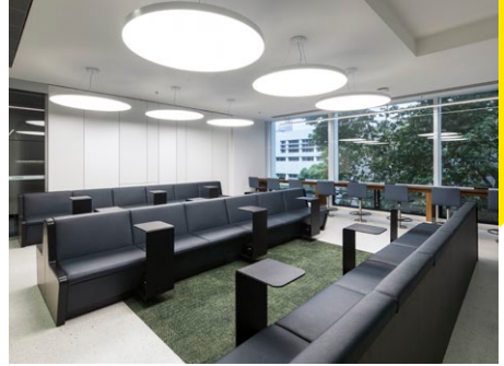
E12 Business School Study Space