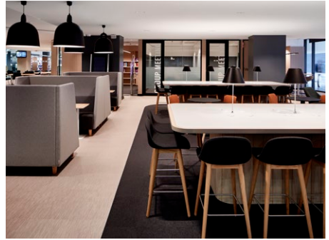
F8 Law Library Study Space