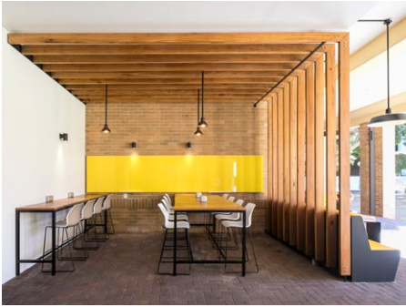
E15 Quadrangle Study Space