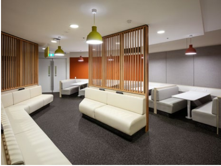
C27 Wallace Wurth Study Space