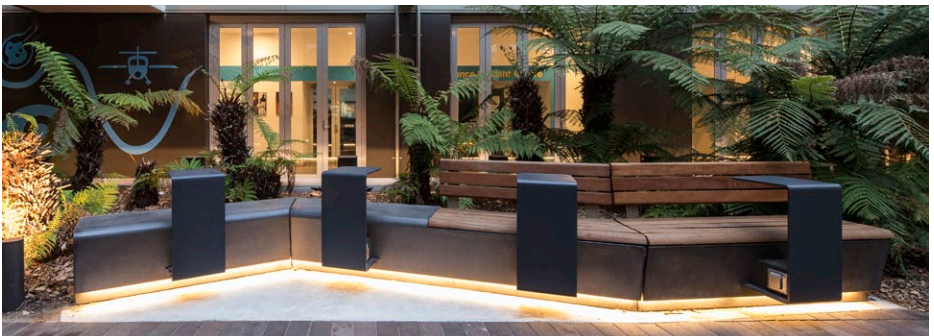
G14 Webster Courtyard Study Space