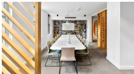
C20 Morven Brown Study Space

Ready to ace your study game? Explore what makes each space unique or visit: unsw.to/studyspaces